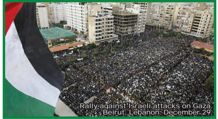
Rally against Israeli attacks on Gaza, Beirut, Lebanon, December 29

We believe in the choice we made, and are quite prepared to repel any assault on our land, country and dignity. We have written our slogans in blood and are both willing and prepared to confront all aggressors, no matter who they may be.