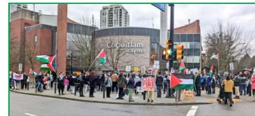
Actions in defence of Gaza & Palestine, Vancouver 5000+ rally Dec 2, 2023; Vancouver Banner Drop Dec 30, 2023, Rally in Coquitlam, Jan 1, 2024

Originally published: October 9, 2023 First updated: November 25, 2023 Last updated: January 5, 2024 Statement by Mobilization Against War & Occupation (MAWO)