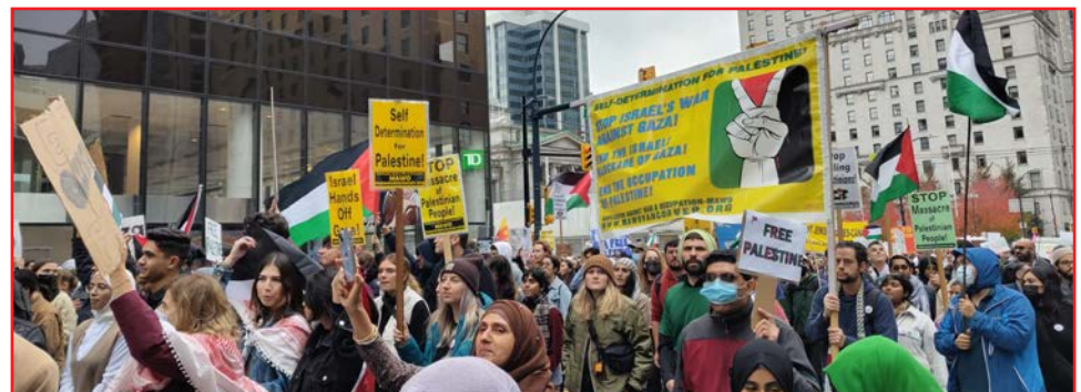
Vancouver 5000+ rally in defence of Gaza & Palestine on October 21, 2023.