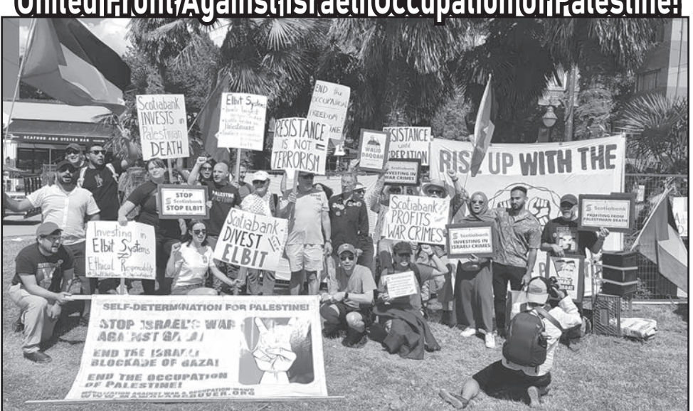
Vancouver Rally for Palestine organized by Samidoun Palestinian Prisoner Solidarity Network on July 22, 2023.

Self-Determination for Palestine! United Front/Against/Israeli/Occupation of Palestinel