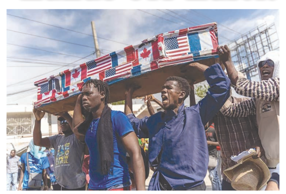
Haitian demonstrators carry a coffin covered with American, Canadian and French flags as they protest foreign intervention on Jean-Jacques Dessalines Day in Port-au-Prince, October 17, 2022.