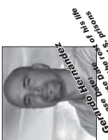
Gerardo Hernández Served 15 years unjustly in U.S. prison