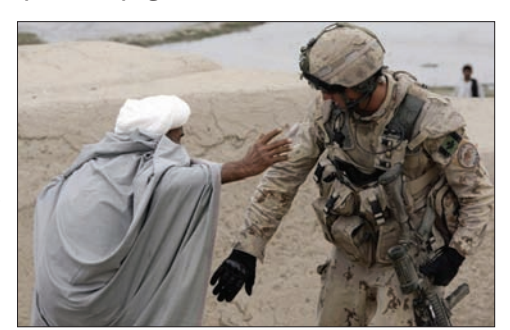
Canadian soldier searches an Afghan man, March 9, 2009.

After nearly nine years of seeing only worsening conditions of daily life, more and more Afghan people are joining the resistance to the occupation forces in their country, whether protesting on the streets or taking up arms to fight the occupiers. The growing resistance has created a deepening crisis and quagmire for the occupation forces as they fight a losing battle against Afghans who are struggling for their dignity and right to self-determination. There can be no better life for Afghans as long as foreign troops remain in the country. There can be no future for women, youth and all people in Afghanistan as long as the imperialist occupiers have turned this country into a military base. The only way forward for