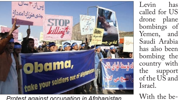
Protest against occupation in Afghanistan. December 30, 2009.

deployment and expanded their war Affrom ghanistan to neighbour-Pakiing stan. In early December