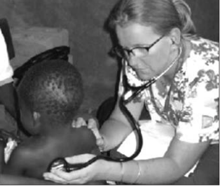
Cuban doctor in Haiti.

• Up to date, 6 thousand and 94 coopera-