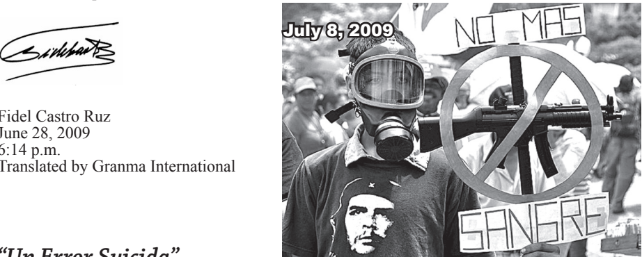
Fidel Castro Ruz June 28, 2009 6:14 p.m. Translated by Granma International

By the afternoon, even Mrs. Clinton had declared that Zelaya is the only president of Honduras, and the Honduran coup leaders can’t even breathe without the support of the United States. In his nightshirt up until a few hours ago, Zelaya will be acknowledged by the world as the only constitutional president of Honduras.