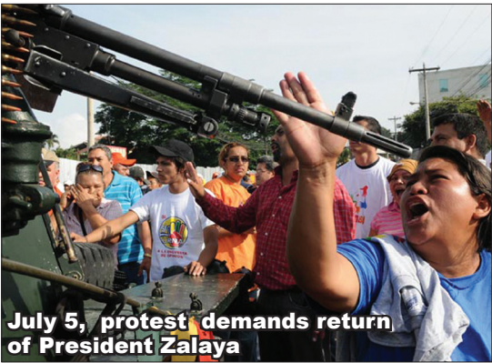
July 5, protest demands return of President Zelaya

Zelaya was overthrown by military thugs because his line of progressive measures was helping people to improve their standard of living, and they were gaining confidence to fight for their rights - especially against imperialist domination. Since the military coup people have been resisting by strikes and all other forms of protest. Marches and rallies are happening