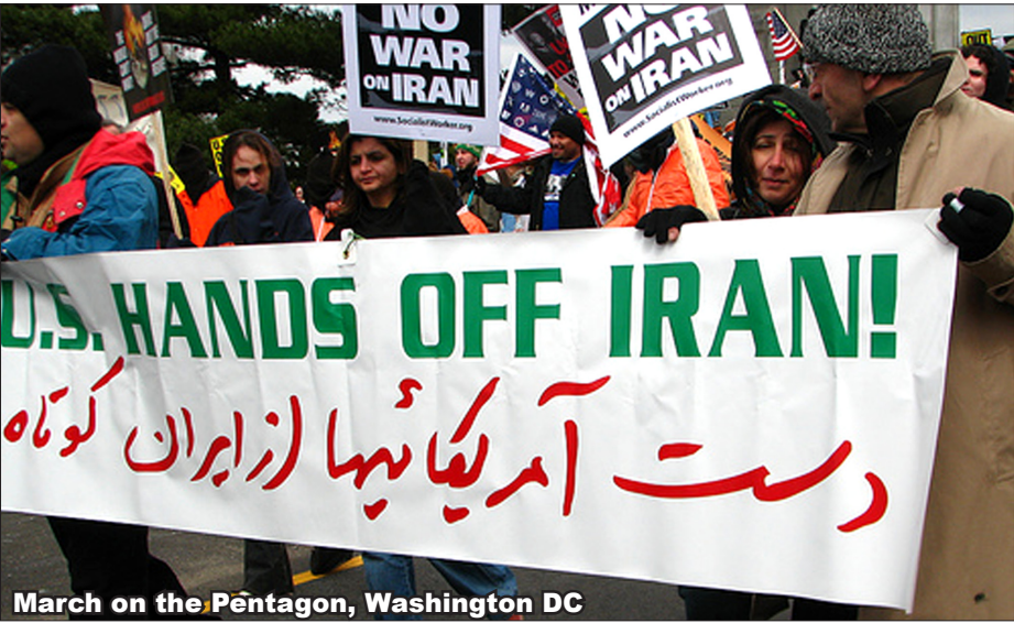
March on the Pentagon, Washington DC

and discrepancies. Not to mention, the illegal occupation of Afghanistan itself undermines any legal and fair election. Where is the voice of the majority of people in Canada, who for over three years, according to many independent and official polls, oppose Canada’s war in Afghanistan?