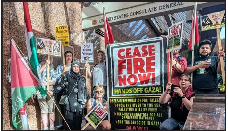
Weekly picket at the U.S. Consulate in Vancouver for Palestine on July 22, 2024