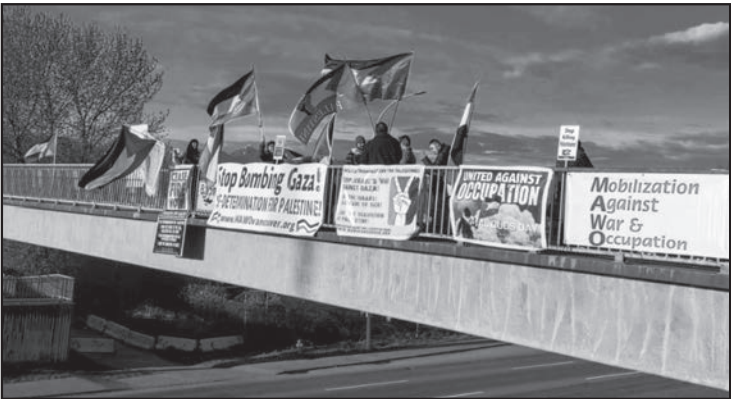
Banner drop for Palestine & Al-Quds Day near Scott Road Station in Surrey on April 5.

Shamefully, Canada’s Foreign Affairs Minister, Mélanie Joly, released a statement in support of Israel. In a statement, Foreign Minister Joly said,