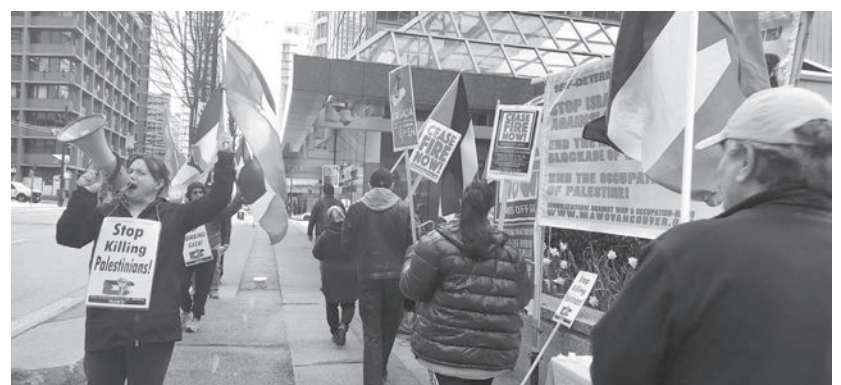
Weekly picket at the U.S. Consulate in Vancouver for Palestine on April 1, 2024.

Imperialist governments, led by the United States, are declaring their support for Israel. The US has moved aircraft carriers to the eastern Mediterranean Sea and several air