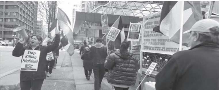
Weekly picket at the U.S. Consulate in Vancouver for Palestine on April 1, 2024.

We have been lied to for years that the Israel-Palestine conflict is “complicated,” and peace is distant. Before the Zionist project with the support of Britain and other imperialists imposed the state of Israel on Palestinian land, Palestinians of Muslim, Jewish and Christian faith lived in harmony side by side for centuries. Despite the claims that Israel needed to be created as a “safe” homeland for Jewish people, there can be no safety when that state is imposed by a genocidal occupation, as has been done on Palestinian land. This was just a convenient solution for racism in Europe and North America, where historically and today Jewish people face antisemitism, where Jewish people should have the right to live without discrimination. In fact, the safest place historically and today for Jewish people has been in West Asian countries, side by side with their Muslim neighbours! The solution that we are told is complicated is in fact simple. Palestinian’s legitimate