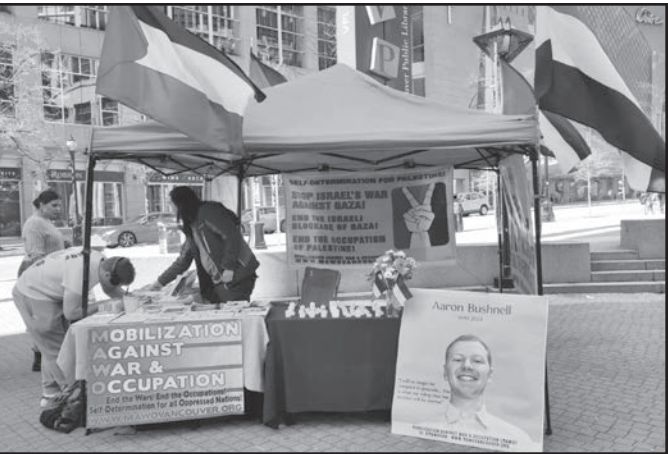
Info tabling for Palestine at the Vancouver Public Library on March 24, 2024.

In part, the ICJ court ruling reads, “The State of Israel shall, in relation to Palestinians,