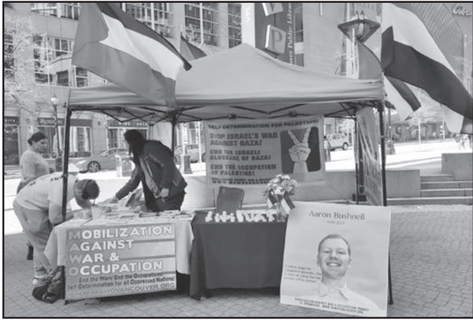
Banner drop for Palestine & Al-Quds Day near Scott Road Station in Surrey on April 5 & Info tabling for Palestine at the Vancouver Public Library on March 24, 2024.

it did implicitly recognize Israel's genocide in Gaza. It implied the South African case charging the Zionist regime of genocide could proceed, and it rejected the Israeli regime's request to dismiss the case altogether. In other words, the ICJ upgraded the legal status of Israel in the ICJ from suspected genocide to accused of genocide, establishing that there is substantial evidence to proceed with the trial. This crushing defeat isolated Israel further worldwide.