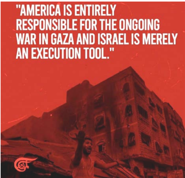
- Sayyed Hasan Nasrallah, Secretary-General of Hezbollah

Planned Starvation & Attack on the World