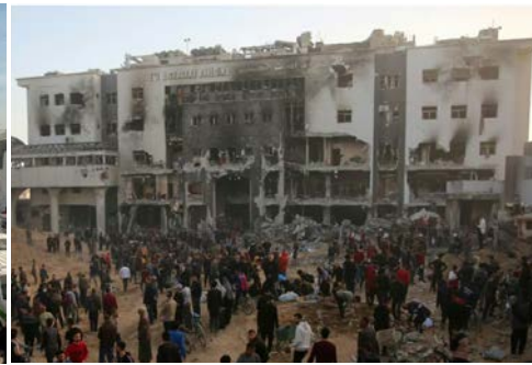
Gaza's Al-Shifa hospital Dec 10, 2023 & after 2 weeks of attack by Israel on April 1, 2024