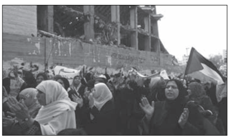
Above: International Women's Day march in Gaza City. March 8, 2009