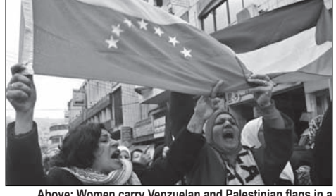
Above: Women carry Venzuelan and Pale protest against Israeli attack on Gaza. Nablus, West Bank, January 11 2009.

SELF-DETERMINATION FOR PALESTINE! RIGHT OF RETURN FOR PALESTINIANS! STOP GENOCIDE IN PALESTINE! LIFT THE BLOCKADE ON GAZA!