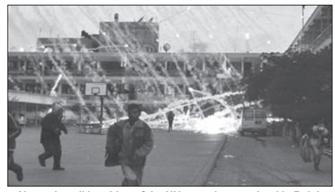
Above: Israeli bombing of the UN-run primary school in Beit Lahiya, Gaza with deadly toxin white phosphorus, January 17, 2009