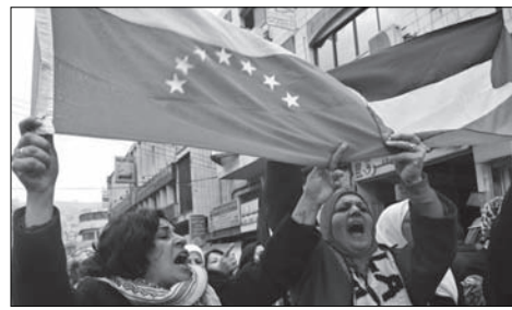
Above: Women carry Venezuelan and Palestinian flags in a protest against Israeli attack on Gaza, Nablus, West Bank, January 11 2009.

We must continue in our efforts and actions, and should not settle for a protest here and a sit-in there, an action here and another there; we ought to invest every effort in defending our people in Gaza.