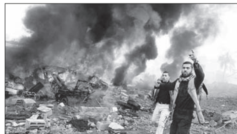
Above: Bombing of Gaza, January 2009.