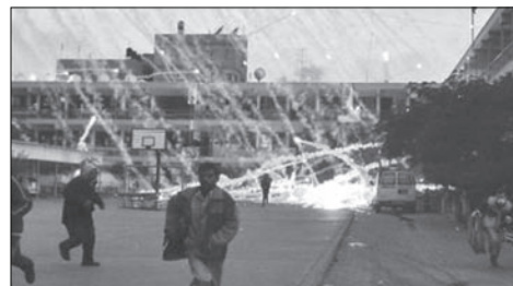
Above: Israeli bombing of the UN-run primary school in Beit Lahia, Gaza with deadly toxin white phosphorus, January 17, 2009.