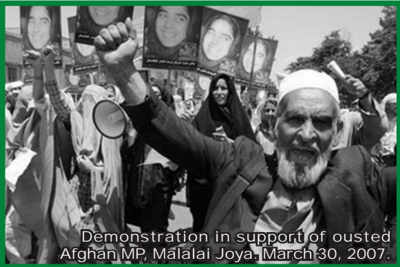
Demonstration in support of ousted Afghan MP, Malalai Joya, March 30, 2007.

John Manley himself said "Canada's future in Afghanistan really transcends partisan politics", and this is very true. For all sections of the ruling class of Canada, whether they're grouped into different political parties or not, the occupation