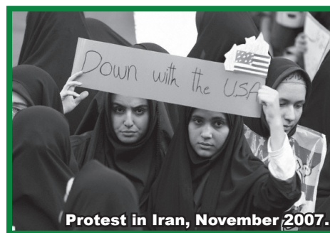
Protest in Iran, November 2007.

Sanctions are an alternative to military force. By punishing a nation economically, socially, and/or politically, it is hoped that change will be affected without the prohibitive cost of war.