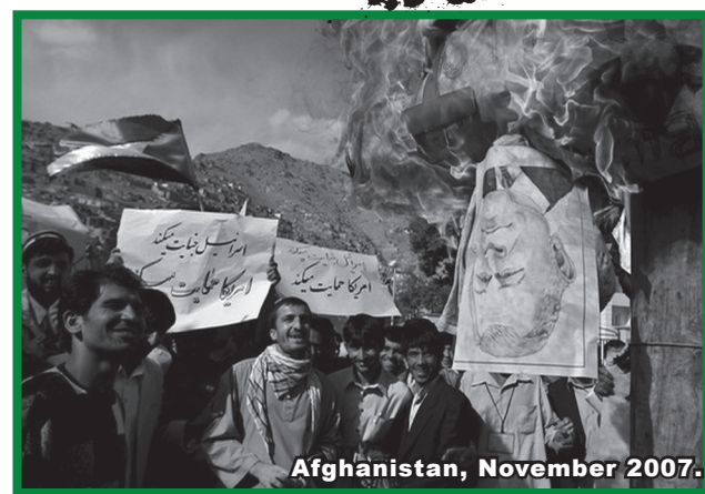
Afghanistan, November 2007.

On Thursday, March 13 th , the Government of Canada passed a motion in Parliament to extend Canada's war in Afghanistan for two more years. The decision was based on a recommendation from the Government of Canada's so-called Independent Advisory Panel on Afghanistan (a panel hand-picked by right-wing Conservative Party leader and Prime Minister of Canada Stephen Harper) to extend the mission. After weeks of debate among the political parties in Parliament, the Conservatives and the Liberals (the two biggest parties in Parliament) agreed on the motion to extend the mission. The New Democratic Party (NDP) and the Bloc Quebecois both voted against the motion.