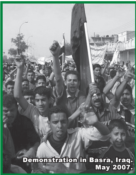
Demonstration in Basra, Iraq. May 2007.

Ryan Cocker, US Ambassador to Iraq, admitted that most Iraqis have electricity for 1 to 2 hours a day and CNN has even now reported that 70% are without access to adequate water supplies.